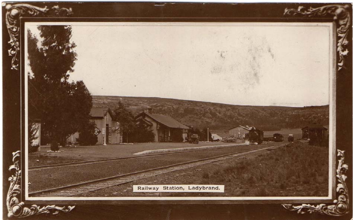
The Ladybrand rail station on a Henderson postcard used 1919