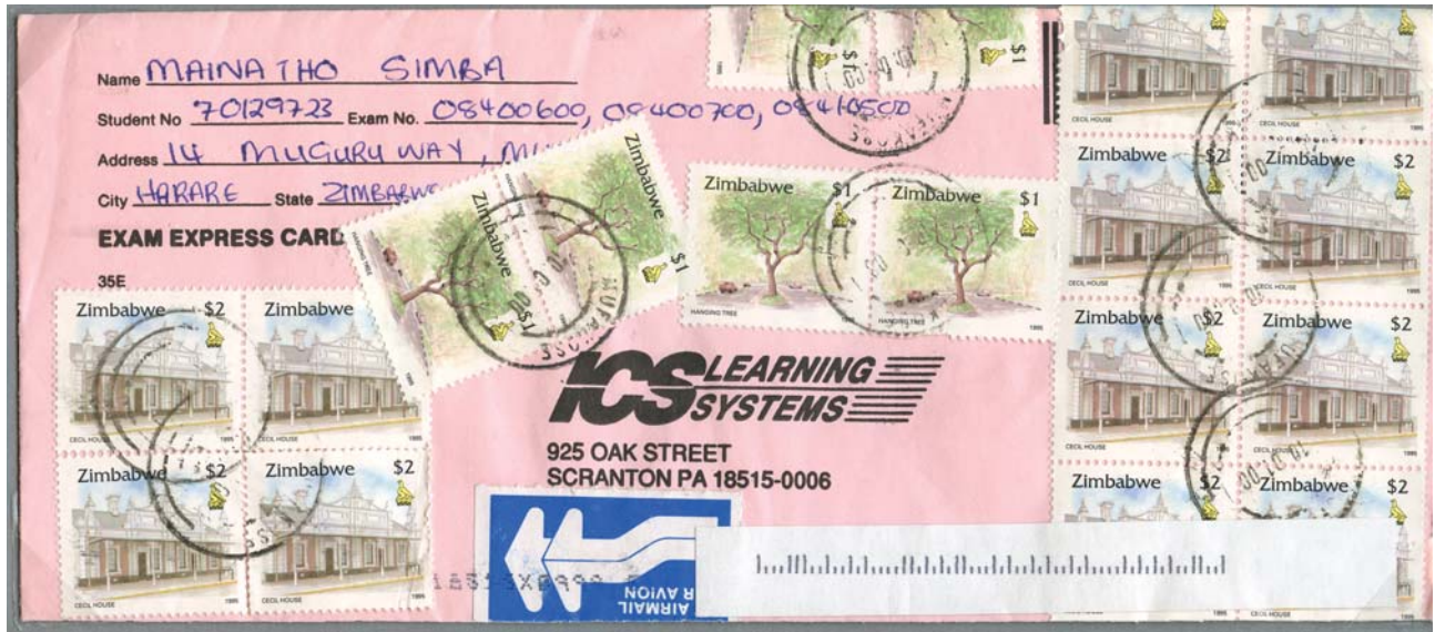
Cover dated 10 January 2000 paying airmail to the ICS in the US. It is franked $30 with 12 stamps of $2 and 6 of $1. Space limited, so lapped over at the top. Reduced to 75 % of the original.