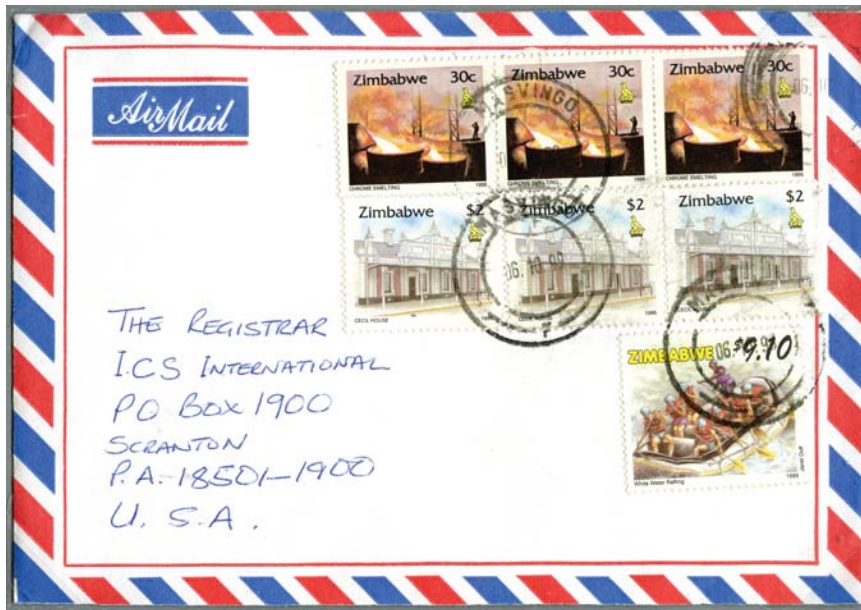
Small format cover dated 6 October 1999 to ICS in the US. Franked with one $9.10 Recreational stamp, three $2 definitives, and two 30c definitive. A total of 7 stamps to make the rate. Masvingo is a substantial town of perhaps 100,000. The smaller envelopes are quite scarce, as almost all mail was business/education oriented.