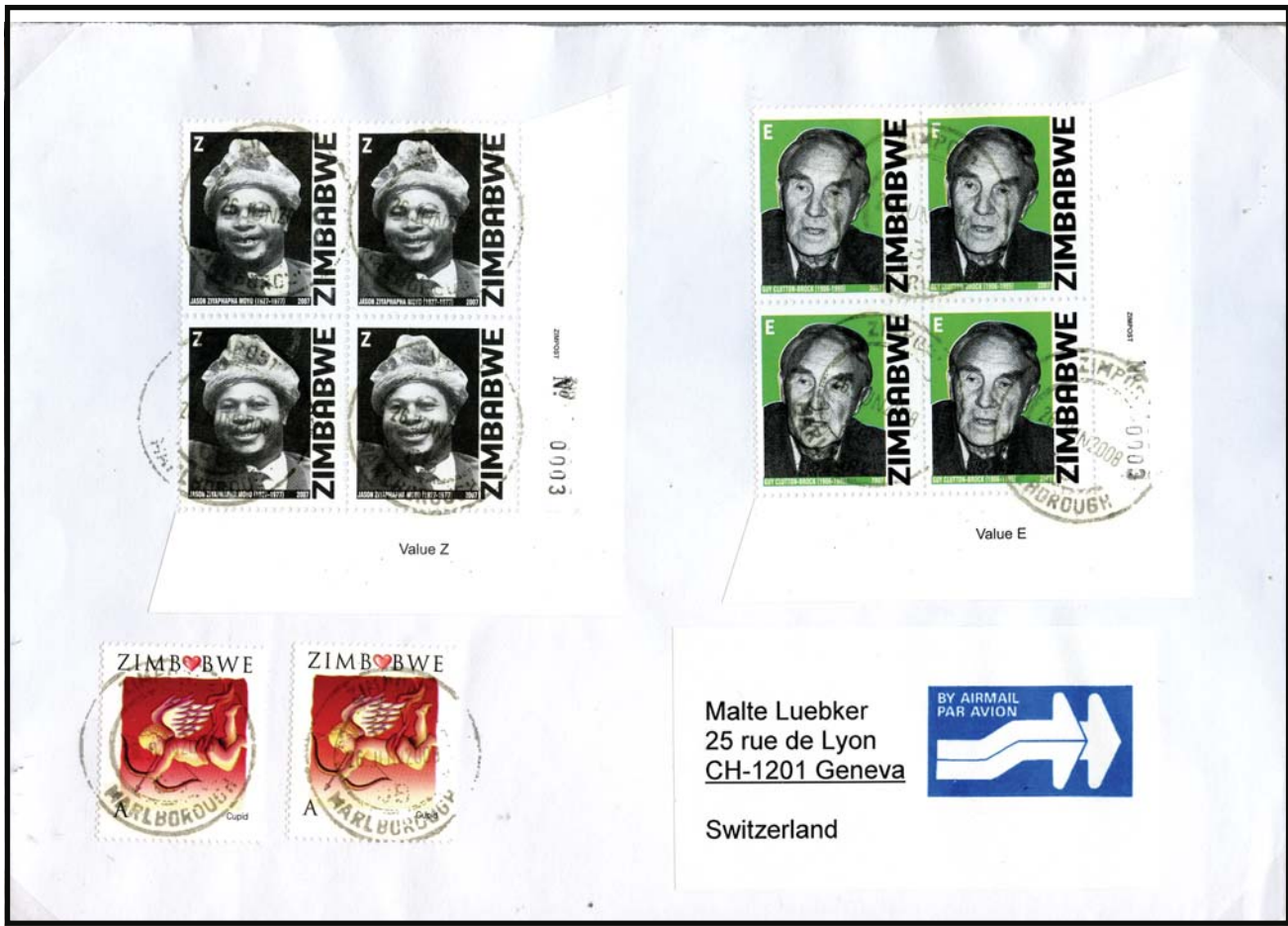
Airmail cover to Switzerland on 23 May, 2008. Franked with 4 Z, 4 E, and 2 A stamps. By this time they provided no values, just a service. Z=Domestic, E=Europe, and A=Africa. This translates to between 9 and 10 billion of the second currency, or 9 to 10 trillion of the original currency.