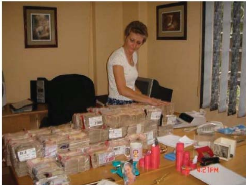
Lady preparing the weekly pay packets for a 4 person office. Then each would take a shopping bag for the money and go spend it quickly.

People there report surviving by using email, the telephone, and private messengers to conduct business. Transactions were by barter, or expressed in foreign currency, mainly the USD or the S. African Rand. In the SW area, the Botswana Pula was in circulation. Grocery stores gave change in credit coupons in USD, and gas stations would sell coupons good for x liters of petrol!