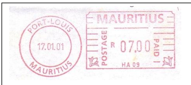
Type I - ERD – 17.01.01, LRD – 29.03.02

Metermark HA 09 is allocated to State Bank Ltd. The volume of mail franked has resulted in no less than three different types of meters with that particular number in service since the late 1990's / early 2000's. The three different types with meter number HA 09 are shown below with the Earliest and Latest Recorded Dates recorded so far. All three meters are of the Hasler 'Mailmaster' model.