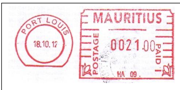
Type III - ERD 18.10.12 – still in use

The second type is unusual as it does not resemble any other known metermark of Mauritius. The rough imprint suggests that it may be a locally manufactured rubber die with a fixed value!