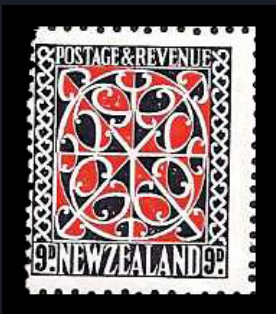
More New Zealand