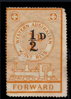
Western Australia Railway

PO BOX 230049 Ansonia Station New York, NY 10023 USA